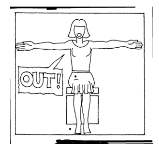
SHUTTLE IS OUT